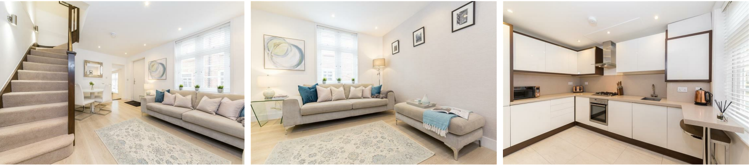
Ground Floor Approx. 290.1 sq. feet

This exclusive Grade 2 listed historic inn yard development is conveniently located in Dolphin Yard just off the top of Holywell Hill and close to all the City has to offer. This exclusive mews development consists of 3 executive designer homes refurbished to a very high standard with modern and stylish finishes throughout to include kitchen/breakfast room, spacious lounge/diner, a stunning four piece white 'Porcelanosa' bathroom and a large master bedroom with fitted wardrobes, The property also benefits from allocated parking